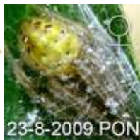
Singa sp POND Female 23-8-2009 DRAGONFLY POND