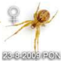
Singa sp POND Female ♀ 23-8-2009 DRAGONFLY POND