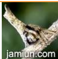
Heurodes sp Tree Stump Orb Weaver Spider http://www.jamiun.com/?p=246