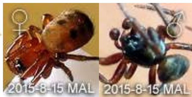
Singa sp MALIAU BROWN Female ♀ 3.5mm Male ♂ 2.5mm