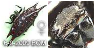
Gasteracantha diardi Female 20mm 6-9-2009 BOMBALAI