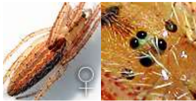
Liprocea fusiformis/Larnia fusiformis Female 9mm Location : Taman Semarak 15-8- 2009