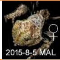
Dolophones sp MALIAU Female ♀ 20mm 2015-08-05 MALIAU RIVER