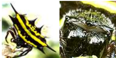
Gasteracantha fornicata Female