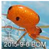
Singa sp BOMBALAI Female 4mm 2015-09-06 BOMBALAI